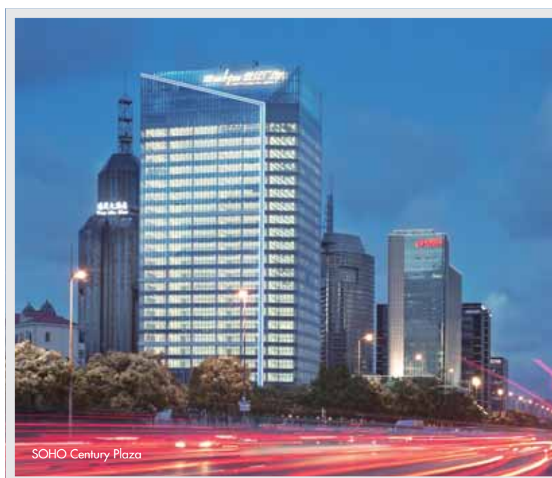
SOHO Century Plaza